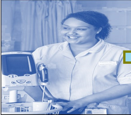
Apprentice Clinical Support Worker